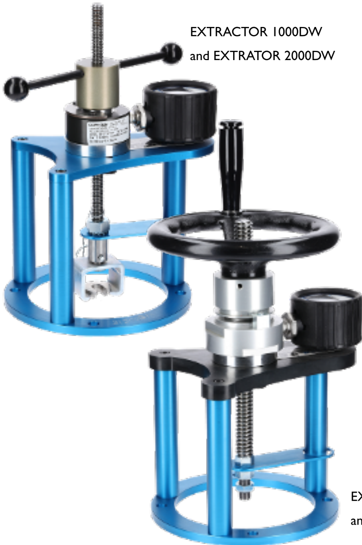
EXTRACTOR 1000DW and EXTRATOR 2000DW